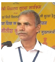
By: Er. Prabhat Kishore

The National Education Policy 2020 emphasizes the importance of creating enabling mechanisms for providing Children With Special Needs (CWSN) or Divyang, the same opportunities of obtaining quality education as any other child.